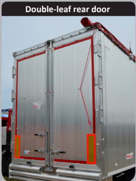
Double-leaf rear door

Half built-in double-leaf door (2 bolts). Continuous welds and continuous side bumper on box for docking.